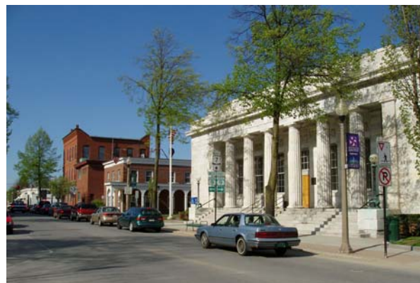
There is a concentration of important historic structures in the Downtown Historic District; the former Federal Building is in the foreground of this photograph looking up South Street.