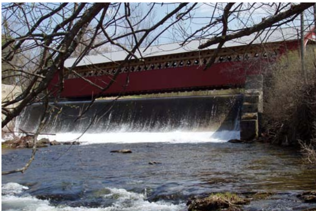
Many of Bennington's historic structures are located along its waterways, such as the three covered bridges over the Walloomsac River.

The Town will continue to pursue funding opportunities that support these objectives. Recent historically appropriate streetscape improvements in the downtown funded through the Transportation Enhancements Program have been particularly effective in this regard. Development of historic properties in Bennington, or of any property in designated historic districts, shall comply with the Town's preservation guidelines and the applicable regulatory design standards.